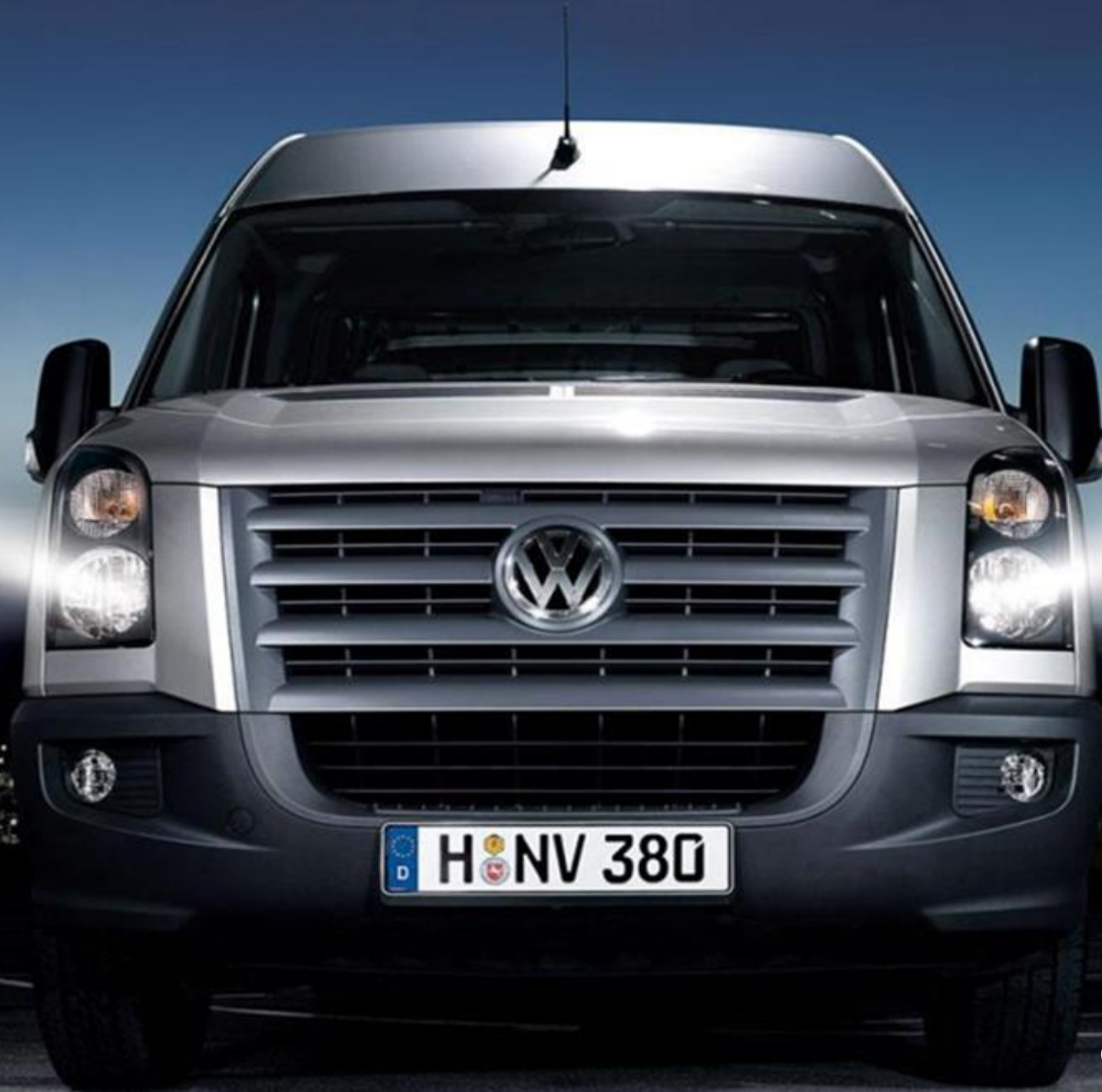
Crafter 35 L