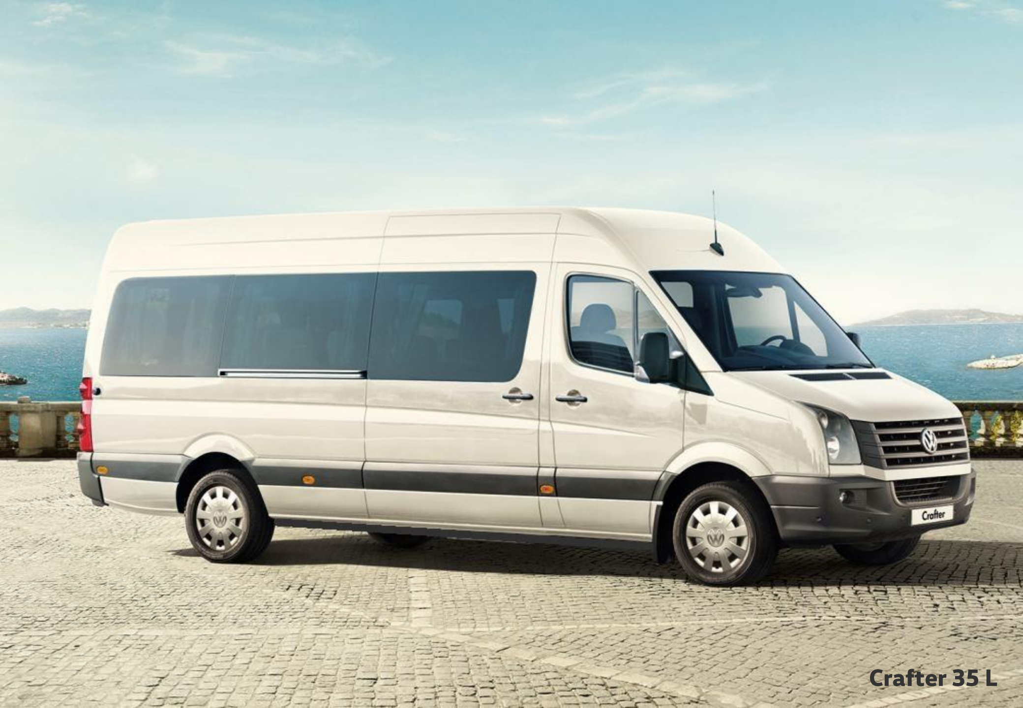
Crafter 35 L