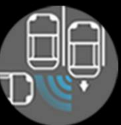
Rear Cross Traffic Alert