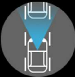
Intelligent Forward Collision Warning with Intelligent Emergency Braking