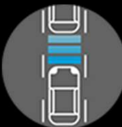
Intelligent Cruise Control