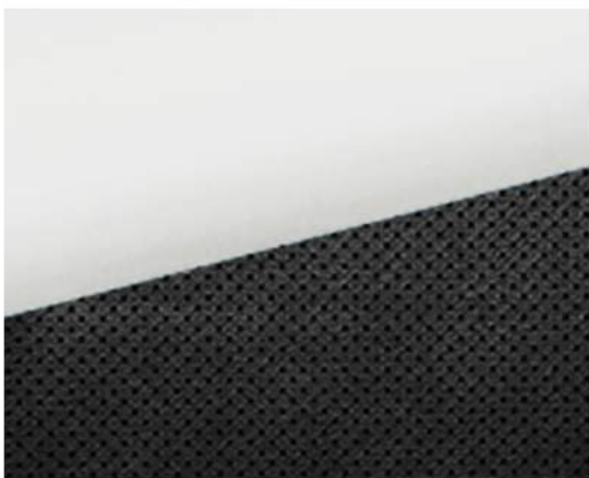
Pearl White Exterior with Black Interior