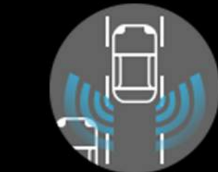
Blind Spot Warning with Intelligent Blind Spot Intervention

A 360° bird's-eye view of your vehicle with split-screen close-ups of the front, rear, and curbside—with Moving Object Detection for added safety.