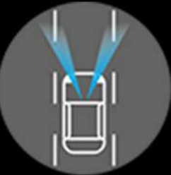
Lane Departure Warning with Intelligent Lane Intervention