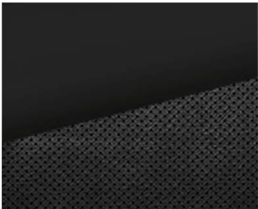
Black Obsidian Exterior with Black Interior