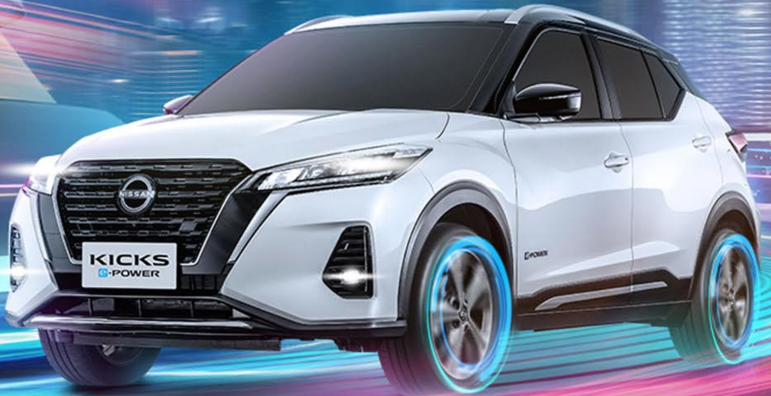
Photo may vary from actual unit.