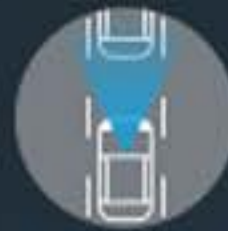
Intelligent Forward Collision Warning