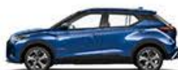
Riptide Blue *VE Exclusive