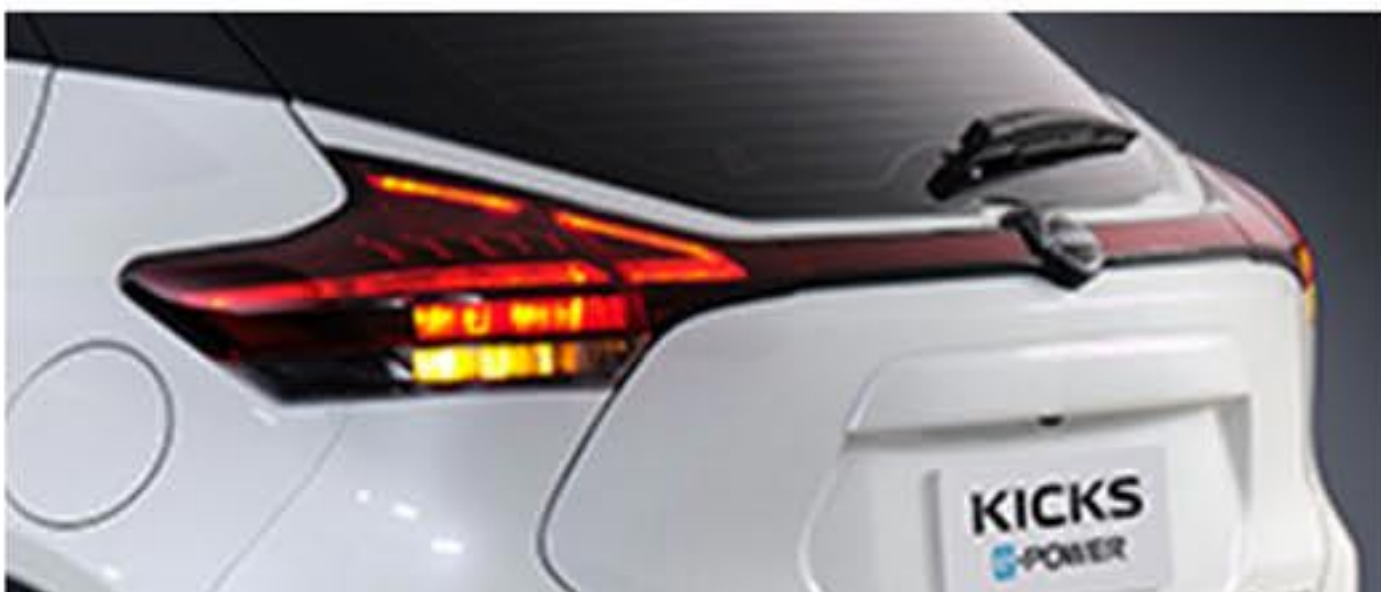
REAR COMB LAMP FINISHER