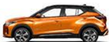
Premium Corona Orange *VL Exclusive

Nissan Philippines, Inc. reserves the right to alter, delete, or enhance features and specifications without prior notice, depending on market requirements.