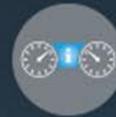
Driver Attention Alert