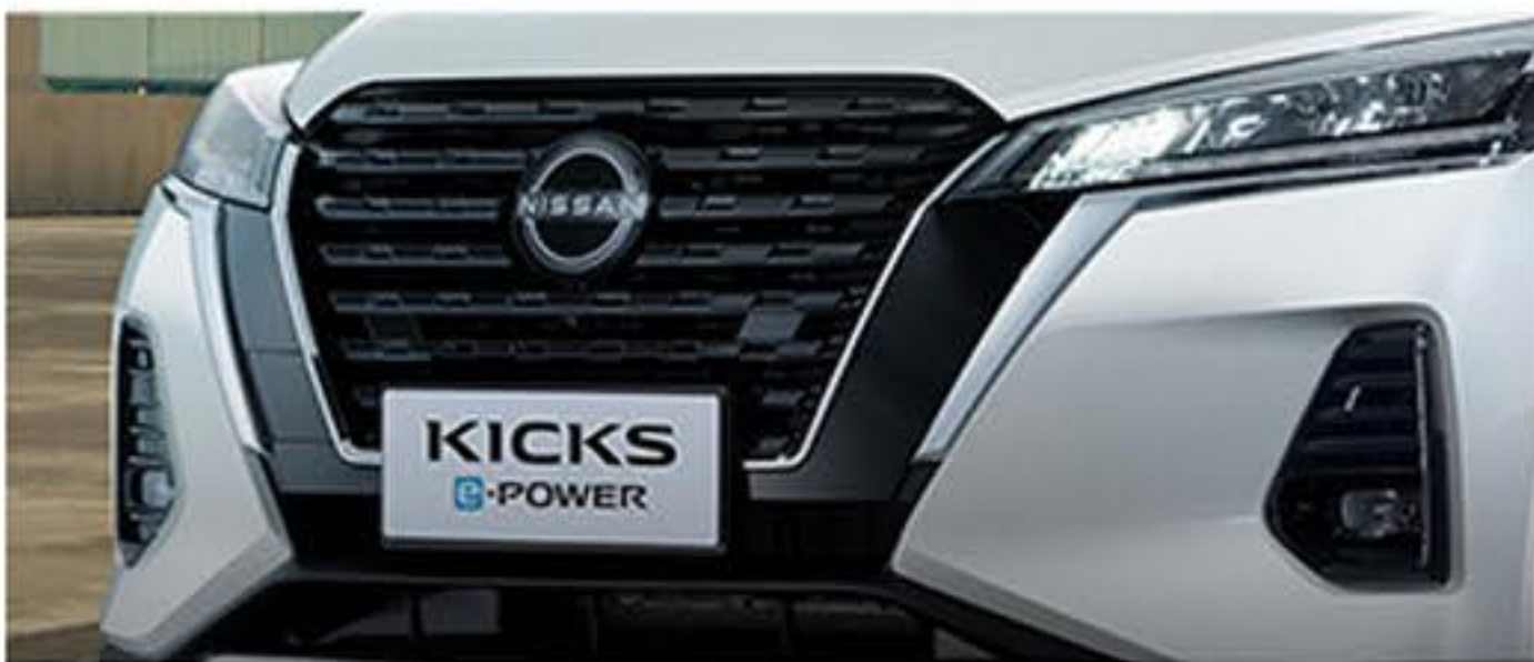
V- MOTION GRILLE DESIGN