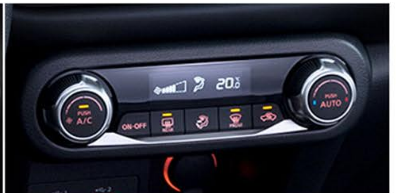
AIR-CONDITIONING SYSTEM WITH AUTOMATIC CLIMATE CONTROL

Photo may vary from actual unit. Nissan Philippines, Inc. reserves the right to alter, delete, or enhance features and specifications without prior notice, depending on market requirements.