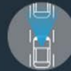
Intelligent Emergency Braking