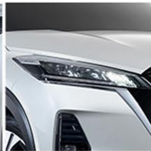
FULL LED HEADLAMPS WITH DAYTIME RUNNING LIGHTS