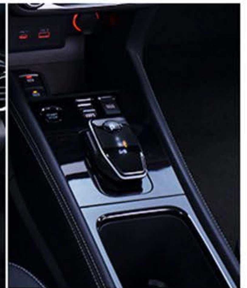
ELECTRONIC GEAR SELECTOR WITH ILLUMINATION