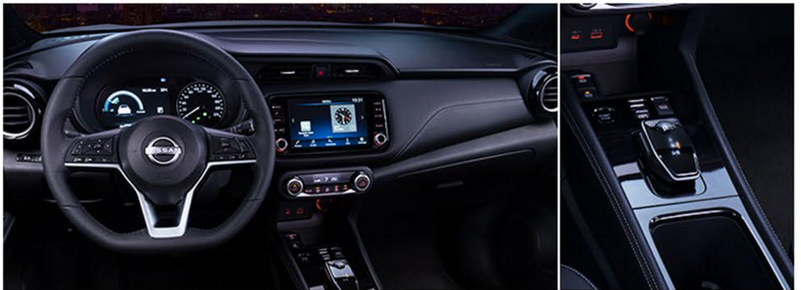
BLACK LEATHER TRIMS WITH SOFT TOUCH MATERIALS