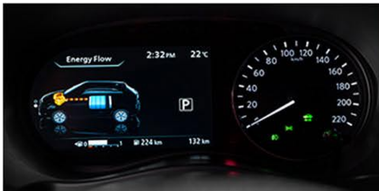
7" TFT METER WITH ADVANCED DRIVE ASSIST DISPLAY