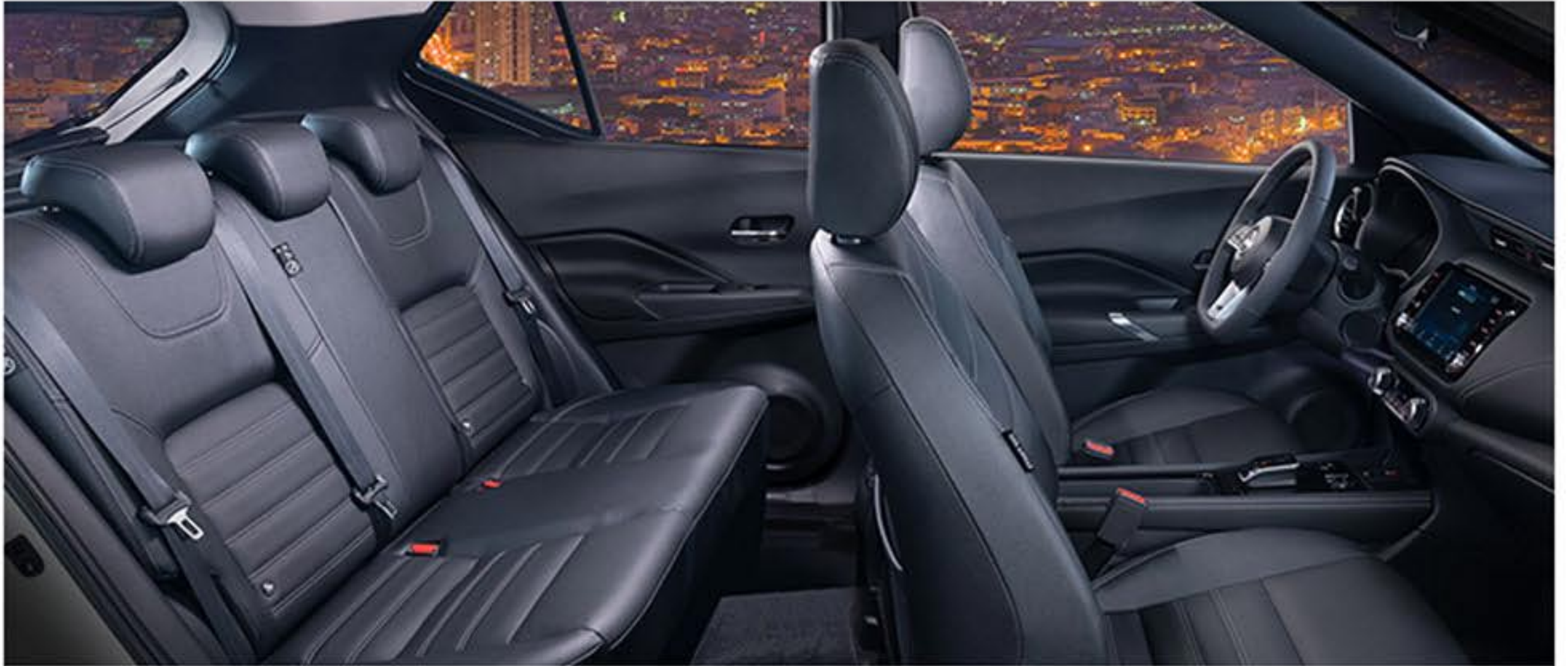
LEATHER SEATS WITH CONTRAST STITCHING

Materials and features are all carefully selected and designed to give you absolute comfort so that you can enjoy the journey as much as the destination.