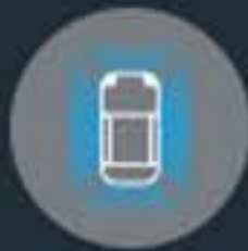
Intelligent Around View Monitor

Drive with complete confidence at every turn. Whether you're getting out of a tight parking space or cruising on the highway, a system designed for safety leads the way.