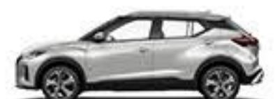
Brilliant Silver *EL Exclusive

*Two-tone colors exclusive to VL variant.