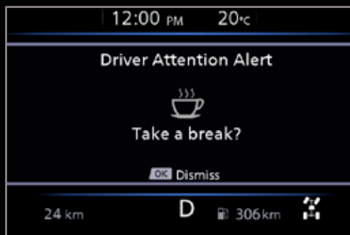
Driver Attention Alert