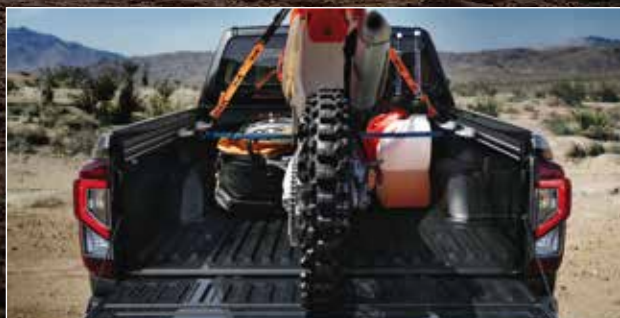
Photo shown with optional bed liner accessory.